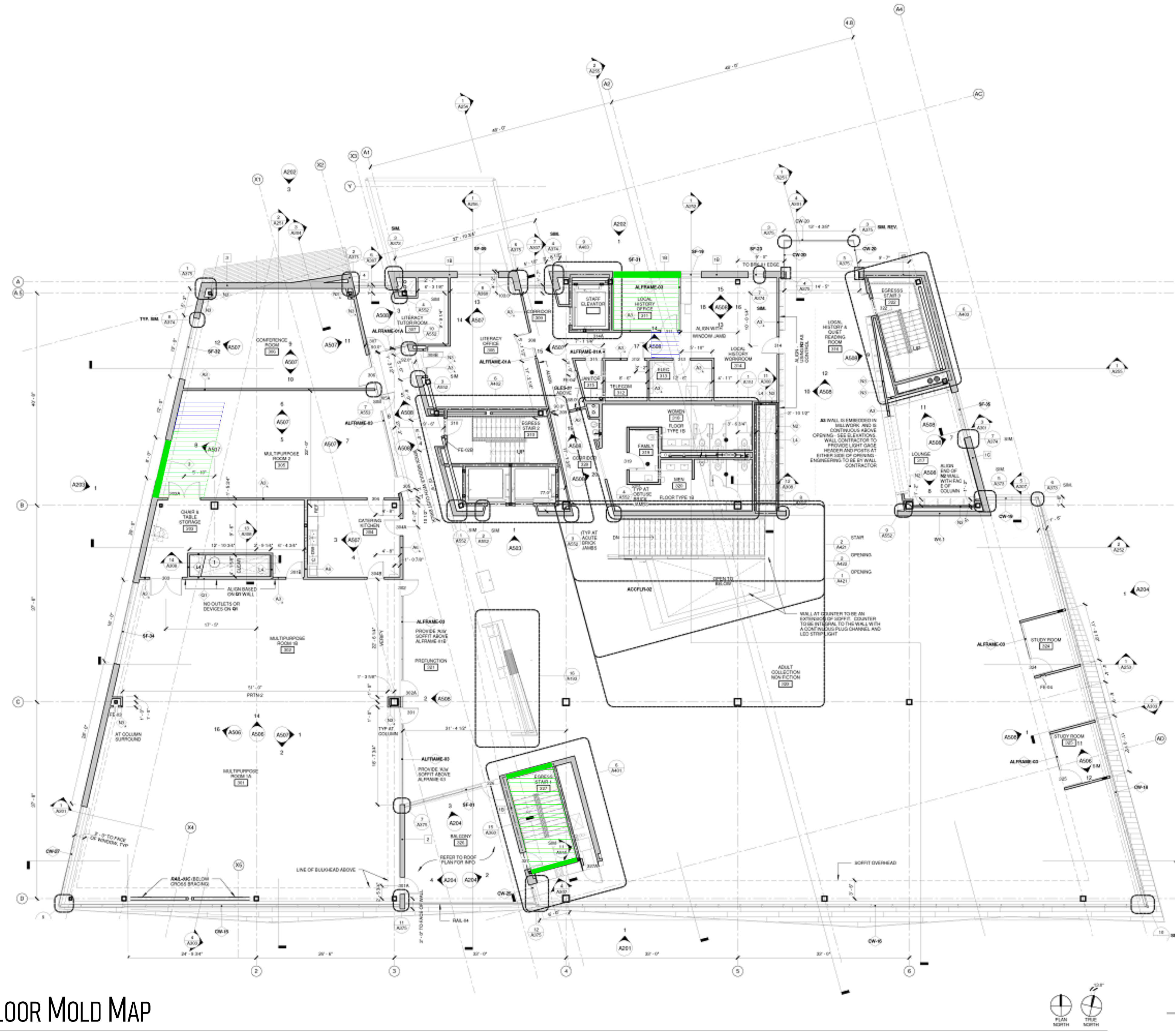
A. 103 THIRD FLOOR MOLD MAP

CAVINS GROUP RESERVES THE RIGHT TO AMEND THIS DOCUMENT AT ANY TIME TO PRESENT THE MOST ACCURATE DATA AVAILABLE.