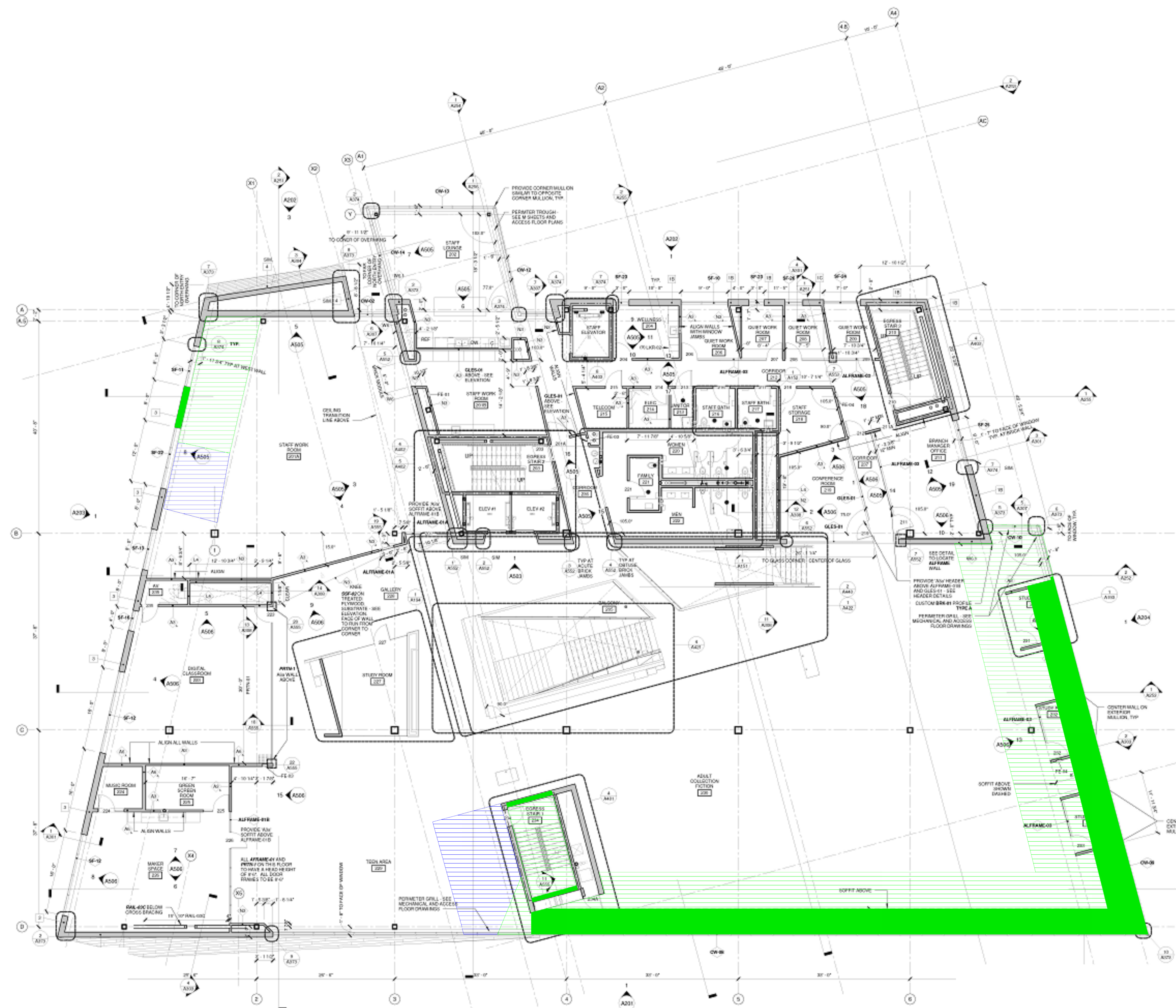
A.102 SECOND FLOOR MOLD MAP

CAVINS GROUP RESERVES THE RIGHT TO AMEND THIS DOCUMENT AT ANY TIME TO PRESENT THE MOST ACCURATE DATA AVAILABLE.