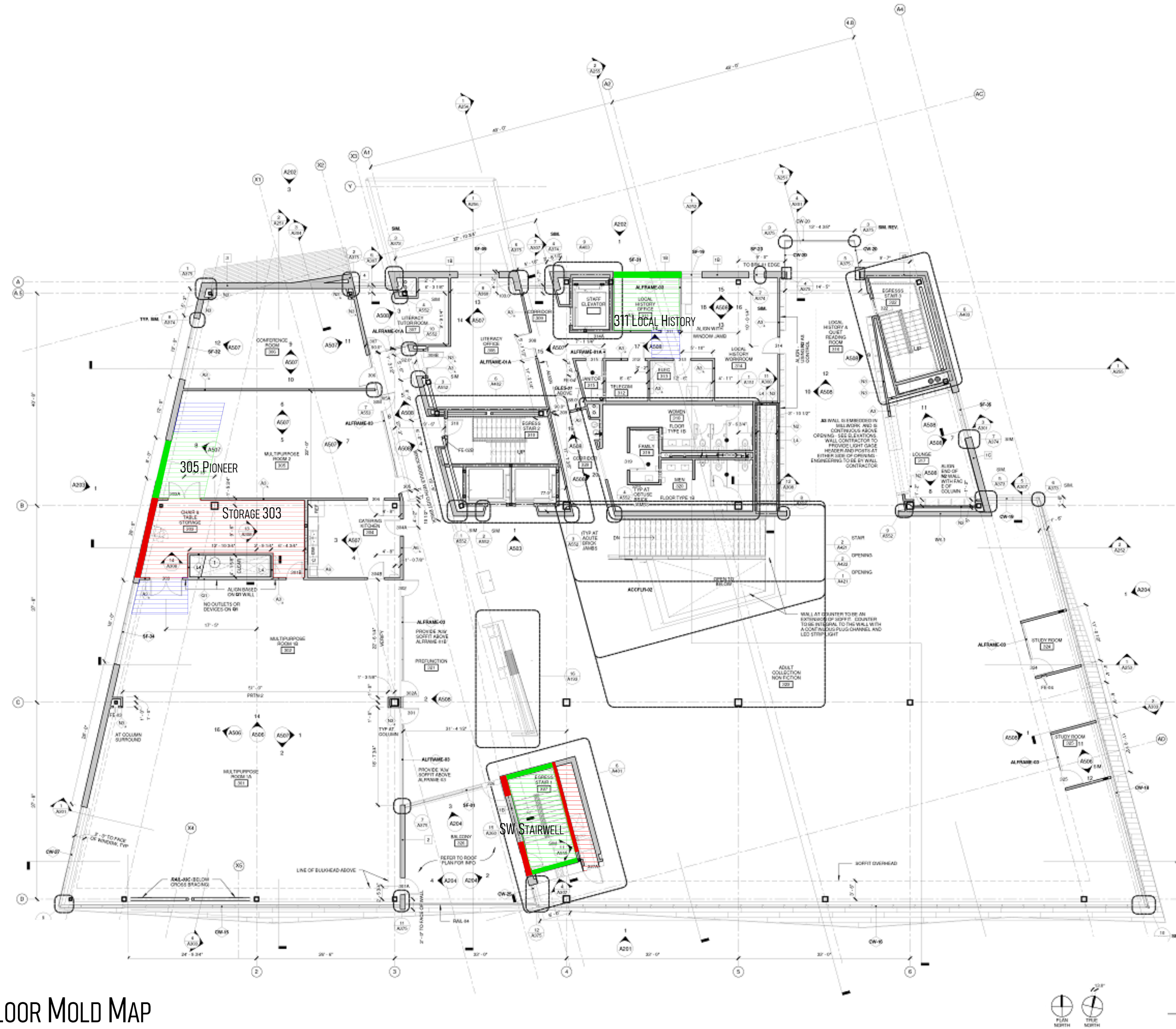
A.103 THIRD FLOOR MOLD MAP

CAVINS GROUP RESERVES THE RIGHT TO AMEND THIS DOCUMENT AT ANY TIME TO PRESENT THE MOST ACCURATE DATA AVAILABLE.