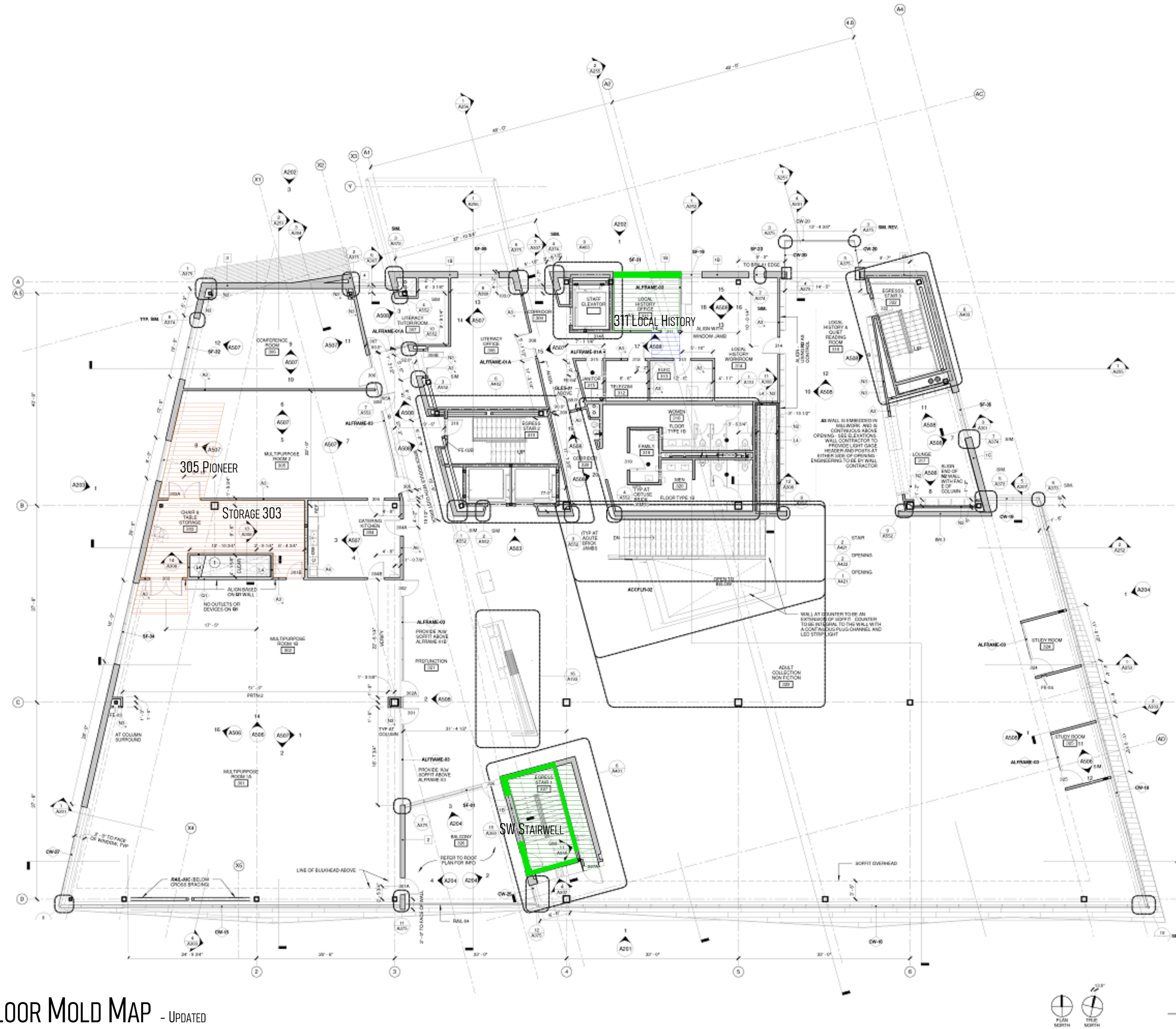
A. 103 THIRD FLOOR MOLD MAP - UPDATED

CAVINS GROUP RESERVES THE RIGHT TO AMEND THIS DOCUMENT AT ANY TIME TO PRESENT THE MOST ACCURATE DATA AVAILABLE.